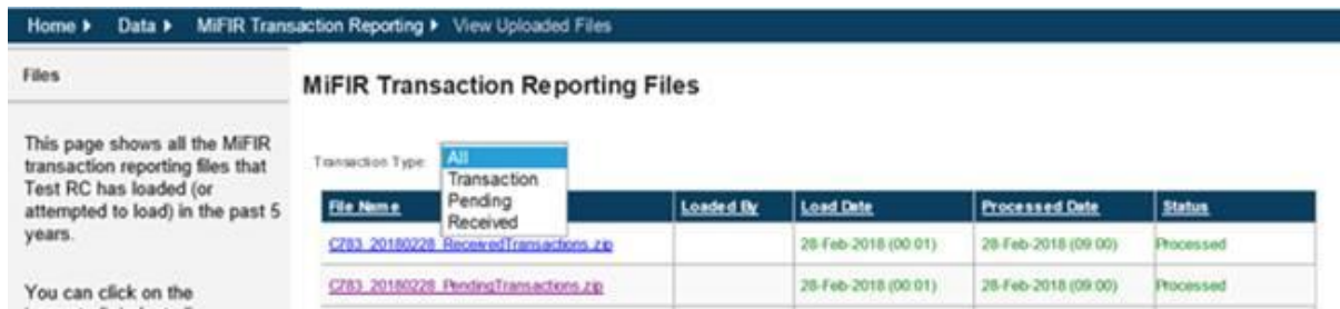
Fig 8 – View Uploaded Files Page – File Type Filter

To access details for any uploaded file select the relevant file under File Name - you will be brought to the File Upload Status and Feedback page (Fig 9).