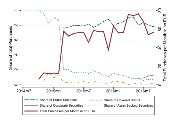
Figure 1: The EAPP Programme

Figure 1 shows the relative share of the different programmes under the Asset Purchasing Programme (APP) as well as the sum of total purchases. These started in October 2014 when the third covered bond purchase programme (CBPP3) and the programme for asset-backed securities (ABSPP) were initiated, summing up to approximately €10 billion per month. In March 2015, the extended asset purchase programme (EAPP) was introduced which adds the extensive public sector purchase programme (PSPP). Representing around 80% of total purchases, this is by far the largest out of the four programmes. It is split into purchases of debt of supranational institutions located in the euro area (12\%)^2 and governments (88%). Thereby, the latter are allocated to bonds issued by euro-area governments according to the so-called capital key, which reflects the GDP and population share of each member state. These two determinants have equal weighting so that countries with a large population and high GDP have a relatively high share compared to smaller countries, such as Ireland (2% in 2015). From June 2016 onwards,