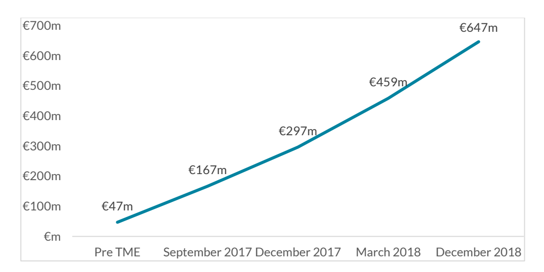
Chart 2: Value of Redress and Compensation Payments

Breaking this down further, 97 per cent of affected customer accounts already identified and verified have now received offers of redress and compensation. Approximately 1,900 accounts (verified and unverified) remain to be paid which we expect lenders to have substantially completed in Q1 2019.