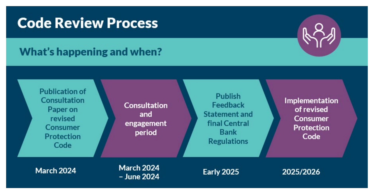
Figure 6 - Timeline of Revised Consumer Protection Code

This consultation paper sets out changes that we are proposing to make under the revised Code. We want to hear the views of stakeholders and the public on our proposals, so we can consider their feedback before we finalise the revised Code. Following completion of the consultation process, we expect to publish the revised Code in early 2025.