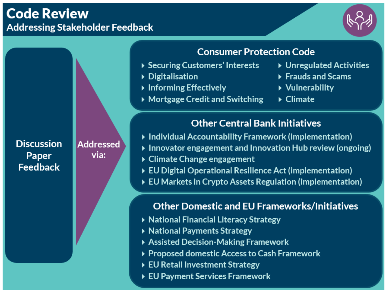
Figure 5 - Code Review Addressing Stakeholder Feedback

Other key Central Bank regulatory initiatives include implementation of the IAF (Conduct Standards for individuals came into force on 29 December 2023) and the Senior Executive Accountability Regime (SEAR) which will come into force on 1 July 2024. The Central Bank has also consulted on proposed changes to our approach to innovation engagement.<sup>18</sup> Work is also progressing on the implementation of the EU Markets in Crypto Assets Regulation (MiCAR)<sup>19</sup>, which will come into full effect by Q1 2025, and the EU Digital Operational Resilience Act<sup>20</sup>, which will apply in full by January 2025. Further communications and engagement will be undertaken by the Central Bank regarding these regulatory developments in due course.