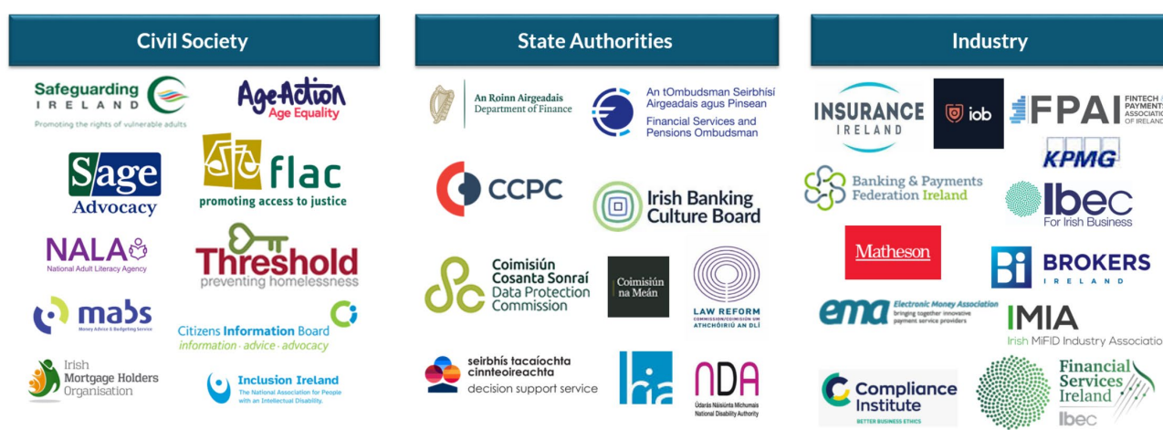
Fig. 1 – Stakeholders engaged with throughout the review of the Code

During the consultation period, we engaged extensively through bilateral meetings, industry events and roundtable sessions. This facilitated engagement with more than 30 stakeholders from individual firms, consumer representative bodies, industry representative bodies, and other regulators and State agencies, including the Data Protection Commission to ensure that the proposals were consistent with data protection legislation. This engagement provided an opportunity for stakeholders to discuss the proposals and for us to support their understanding of those proposals.