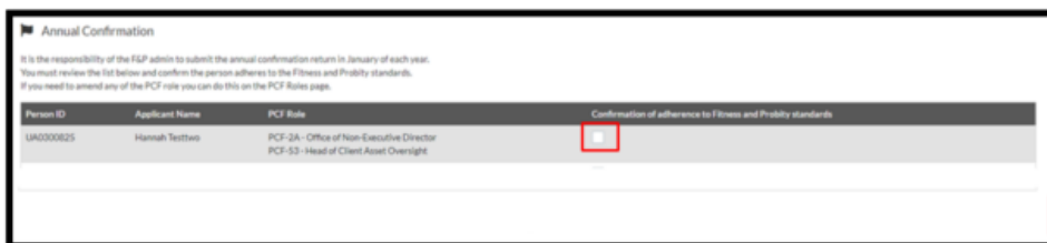
Fig 3.1 – Annual Confirmation

The user should navigate to the 'Annual Confirmation' Page of the Fitness and Probity Menu on the Portal. The user should review the list of PCF holders to ensure accuracy. The Admin must then tick to confirm adherence to the Fitness and Probity standards for each PCF function holder. The user will not be able to make the submission until all PCF holders have been selected as confirmed.