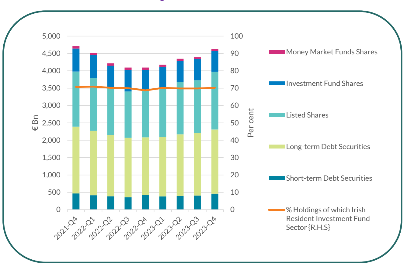
Chart 1: Total Securities Holdings of Irish Residents