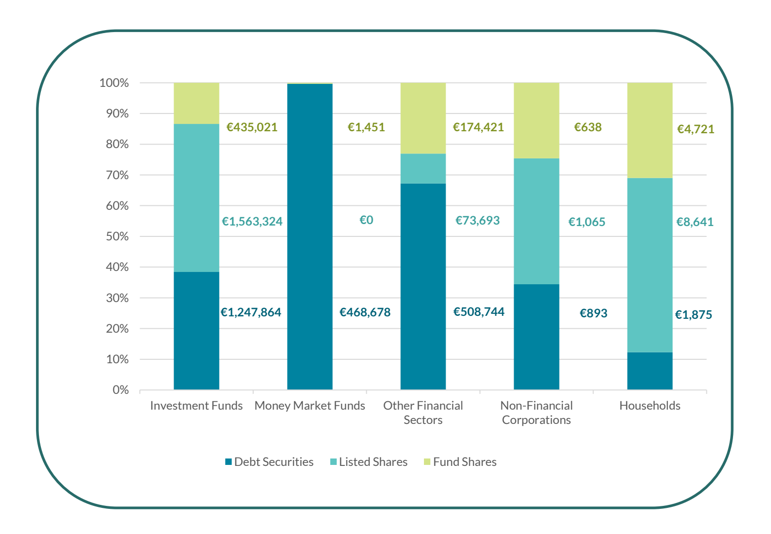
Chart 4: Sector Holding By Instrument Type (€Bn)