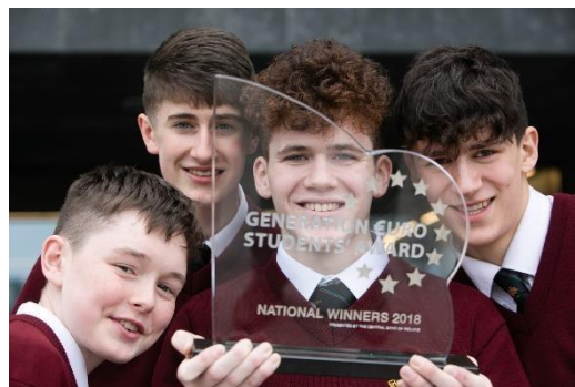
National Winners 2017/2018, Gonzaga College, Dublin

Students must nominate a Team Captain who will co-ordinate the work of the team throughout the competition. The composition of the team should not change during the competition unless under exceptional circumstances, such as illness. In such cases, teams may nominate a reserve student and notify the Central Bank of Ireland.