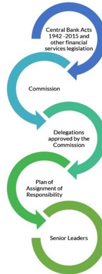
Figure 1: Diagram to represent the Central Bank's legislative environment, delegations and the Plan.